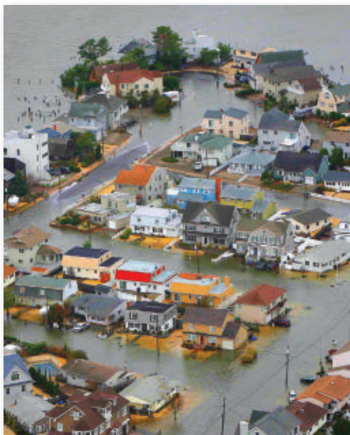
Flooding on the bay side of Seaside, New Jersey, was extensive after Hurricane Sandy made landfall. The unprecedented storm surge prompted the National Oceanic and Atmospheric Administration to increase the number of storm surge forecasters at the National Hurricane Center beginning with the 2013 Atlantic hurricane season.

Summit participants focused on the creation of a shared framework for resilient flood risk management that requires a systems approach that targets the hazard and facilitates the consideration of all aspects of reducing risk and balancing resources and then communicates the risk to the stakeholders. Formulating a vision of future flood risk management requires clear and appropriate policies, as well as guidelines and standards that