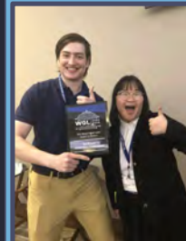
Quiz Bowl (1st)