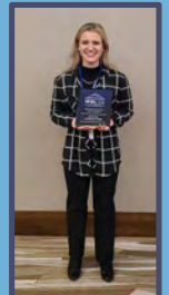
Technical Paper (3rd)