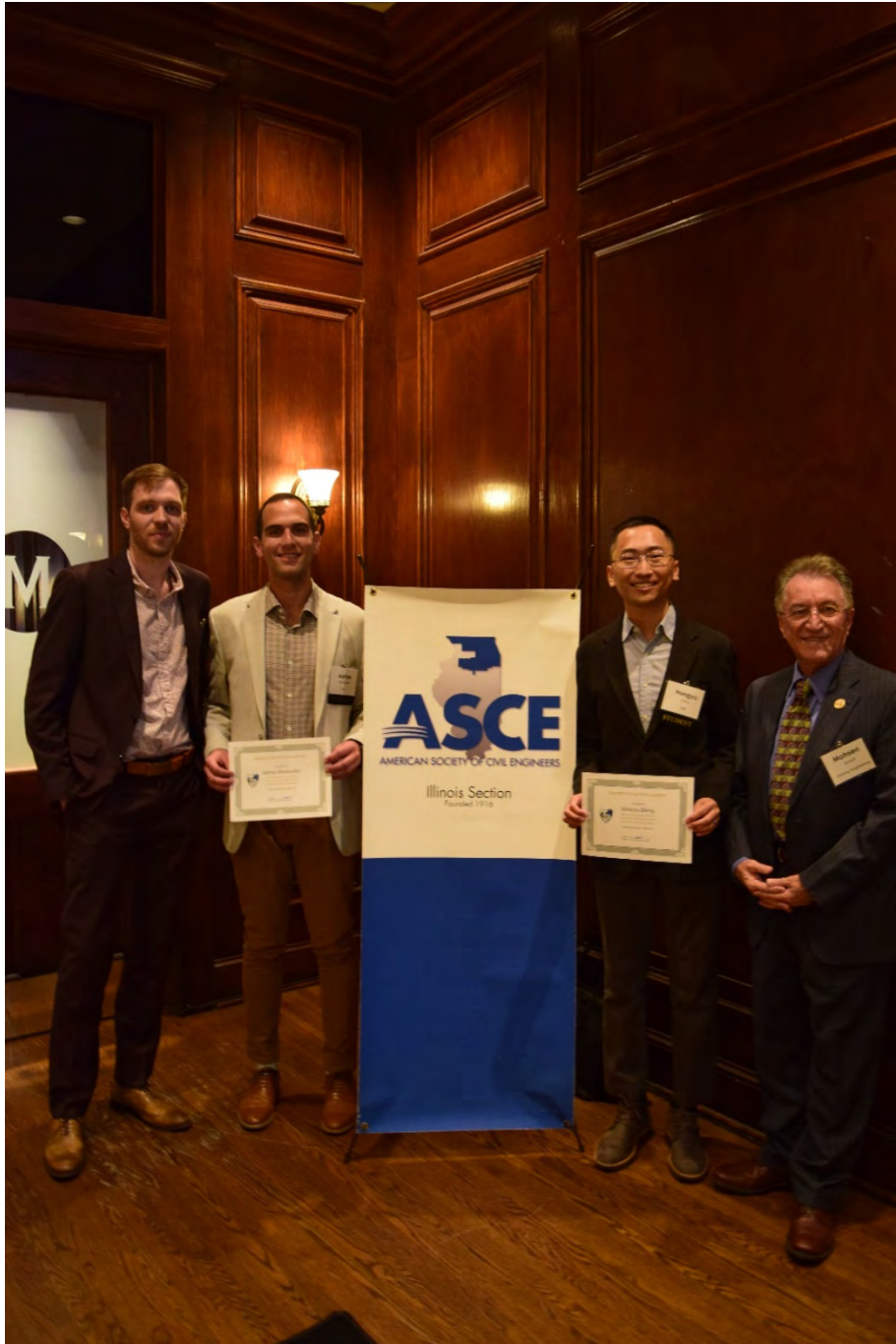
Transportation & Development Institute