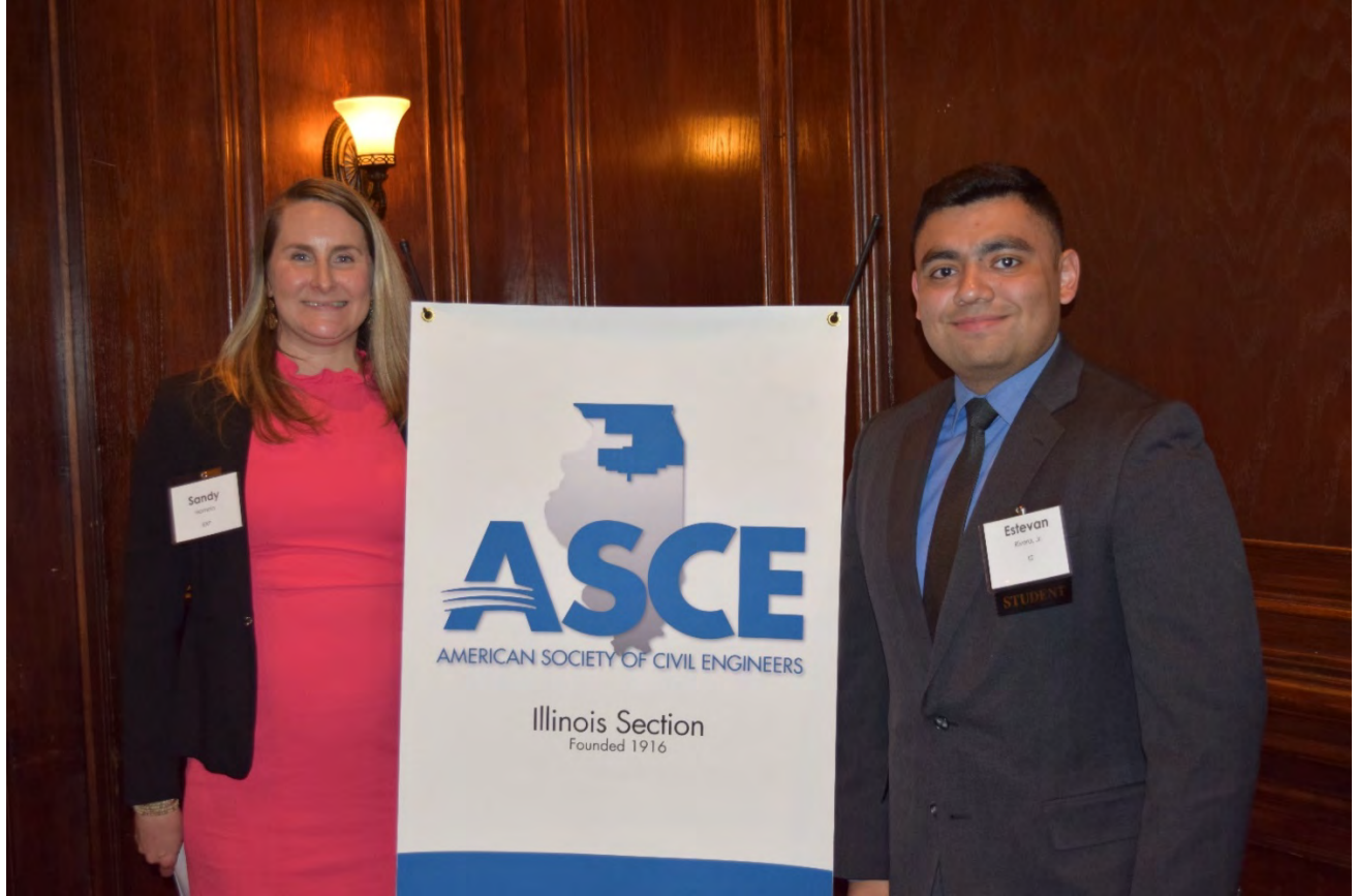
Illinois Section Commendation Scholarship