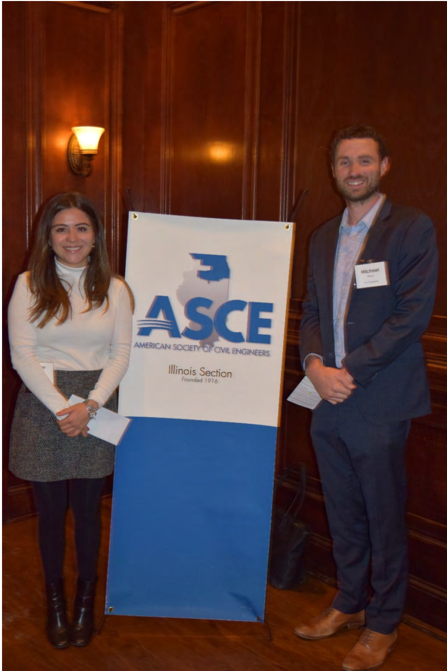
Construction Institute Scholarship