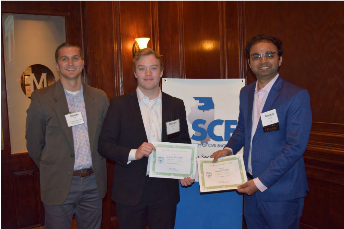
Environmental & Water Resources Institute Scholarship