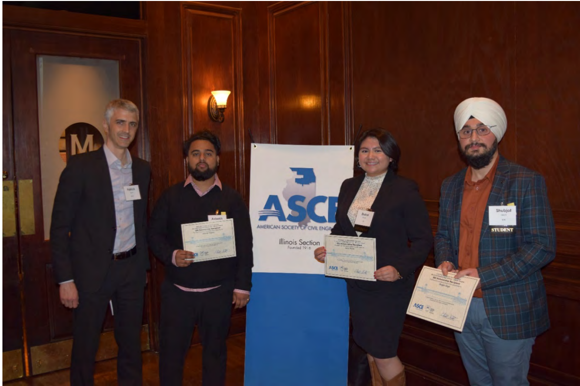
Structural Engineering Institute Illinois Chapter Scholarship